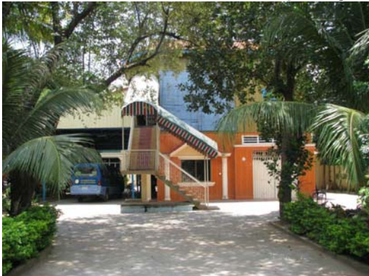
New location of NFC at Chhbar Ampov

We're very excited to share that NFC has moved to new property and we now have a 5-year lease! The new property is located in the south of Phnom Penh about 1.5 Km across the Monivong Bridge.