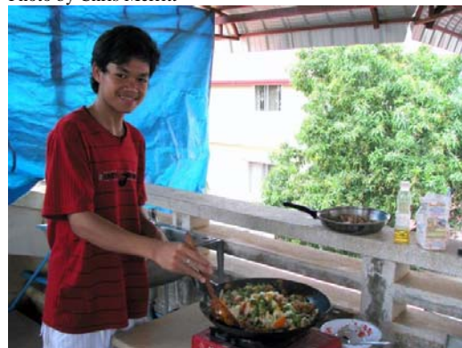
Mnorsen cooking a Thai stir fry.

Some of the children have been continuing to learn to buy, prepare and cook Thai food after the workshop by Rattana of Pepper East. They have prepared delicious Thai dishes, such as curries and soups, for NFC volunteers on Fridays at NFC. This has become a special event for both the children and volunteers.