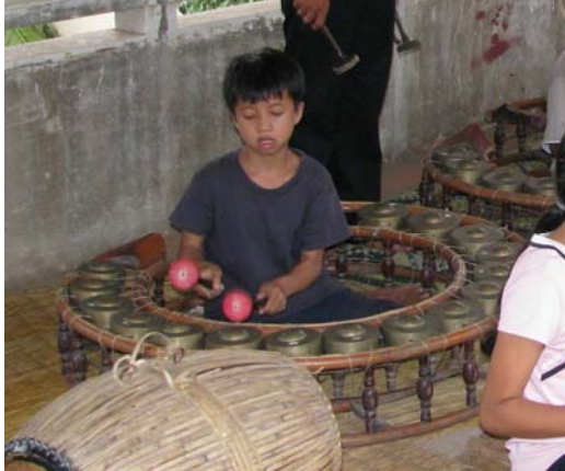
Brostouch playing the kong vong toch.